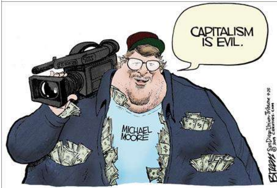
SAID THE MULTIMILLIONAIRE FILMMAKER